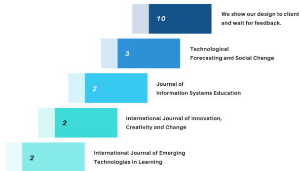
Fig. 3. Distribution of literature journal base publications

Furthermore, the journal base publication analysis is conducted for the current study and finds that ten conference papers are selected for the current study. Second, most reviews are select from the Technological Forecasting and Social Change with 3 in number. Gradually the name of the studies is going down for the current study. Journal of Information Systems Education contributes, has added two articles. Figure 3 is showing the results of the research article selected from each journal.