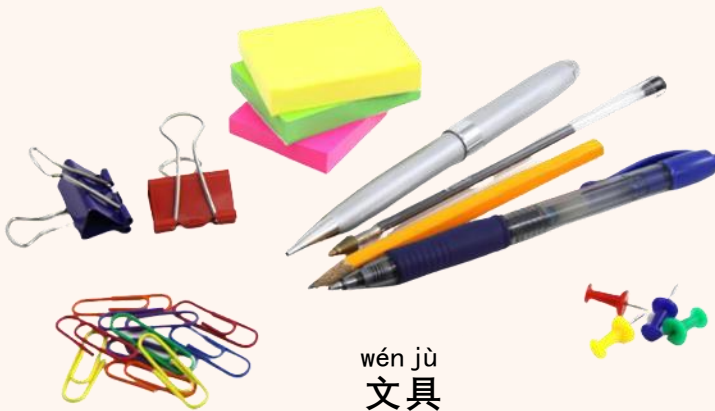
wén jù 文具 Stationery