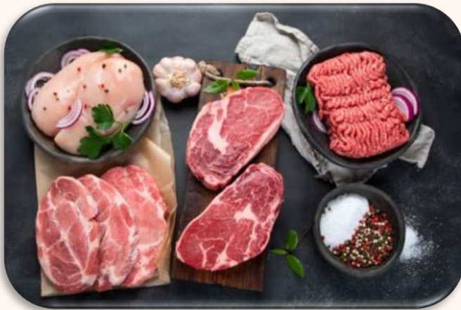
ròu lèi 肉类 Meat