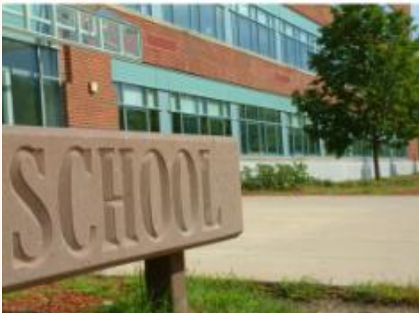
xué xiào 学校 School