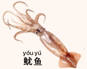
yóu yú 鱿鱼 Squid