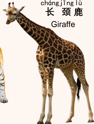
chángjǐng lù 长颈鹿 Giraffe