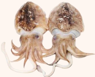
mò yú / wū zéi 墨鱼/乌贼 Cuttlefish

What are the differences between cuttlefish, octopus, and squid?