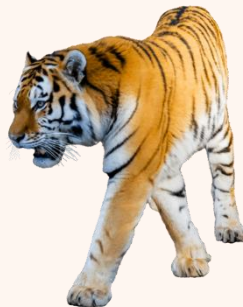
lǎo hǔ 老虎 Tiger