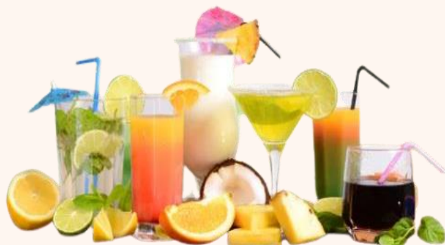
yǐnliào 饮料 Drinks