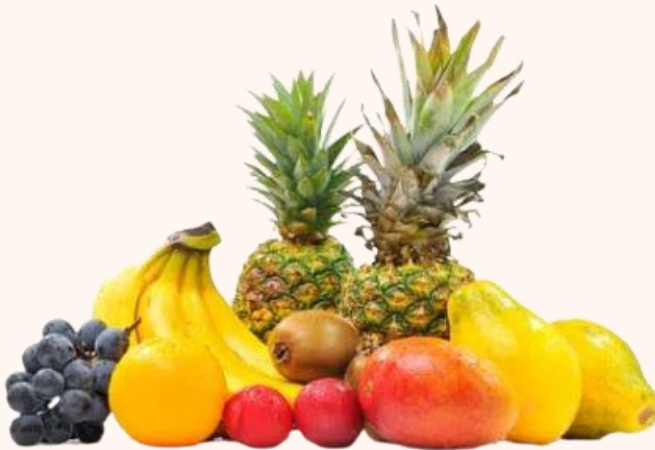
shuǐguǒ 水果 Fruits