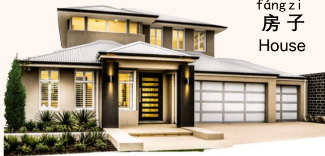
fáng zi 房子 House