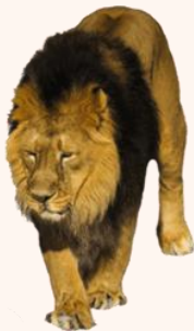
shī zi 狮子 Lion