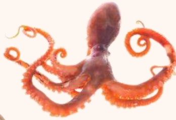
bā zhuǎ yú 八爪鱼 Octopus