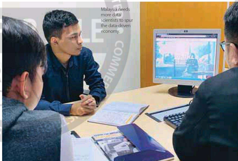
Malaysia needs more data scientists to spur the data-driven economy.

"Data scientists are highly educated; 88% have at least a Master's degree and 46% have PhDs and although there are notable exceptions, a very strong education background is generally needed to build the breadth of knowledge